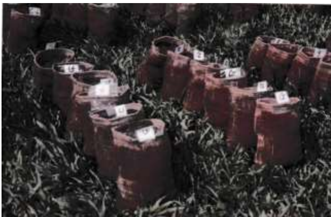
Fig.1. Rot-proof jute based nursery pots in the experimental field.

Eighty nursery pots were set-up in the experimental field. Six pots were prepared for each treatment. Jack fruit is our national fruit of Bangladesh. Jack fruit seeds were sown in the nursery pot. Eight pots were prepared from untreated fabrics. It was found that untreated nursery pot lost its strength within fifteen days and was damaged within one month of plantation. The untreated pot degraded very easily due to the growth of fungi and other micro-organisms [6]. All these treated fabrics were exposed in the soil condition.