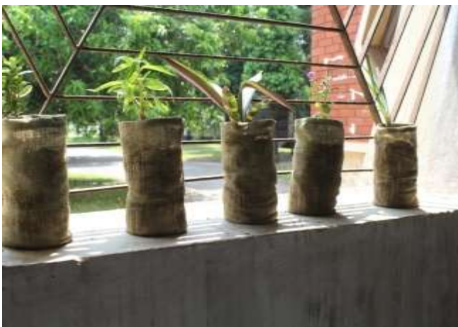
Fig.2. Rot-proof jute based nursery pots.