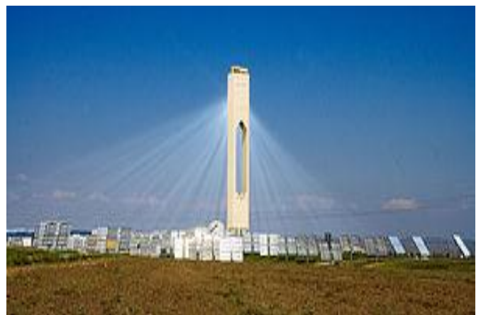
Fig. 2 Solar Power Tower

Third type is parabolic dish type in which focusing type is fixed which is point in one point we get all energy and tracking axis is two which type generally use in various application concentration ration is 600 to 2000 due to that temperature range is also high which is 100 to 1500 degree Celsius. Forth type is solar tower which is also point type focus and two tracking axis concentration ration is 300 to 1500 which gives temperature is 150 to 2000 degree Celsius temperature. The solar power tower is also called as 'central tower' power plants or 'heliostat' power plants or power towers in which is a type of solar furnace using a tower to receive the focused sunlight. It applicator for an array of flat, movable mirrors (called heliostats) to focus the sun's rays upon a collector tower (the target).