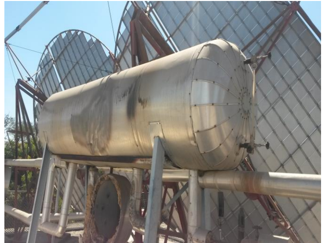
Fig.5 Water Storage device

This Instrument are use foe changing Angle of parabolic dish which is change type. Where handle arrangement is there by suing that dish angle will changes. Rotation of devise is measure and respect to changes rotation angle of dish type parabolic observe.