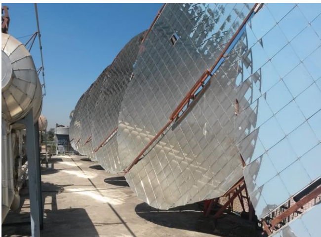
Fig.3 Parabolic Type Dish.

We work on parabolic dish type for observation of temperature. Generally mostly use of solar type this parabolic type dish are use where angle will be changes by manually.