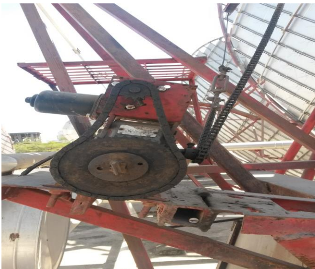
Fig.4 Angle changing handle

This Instrument are use foe changing Angle of parabolic dish which is change type. Where handle arrangement is there by suing that dish angle will changes. Rotation of devise is measure and respect to changes rotation angle of dish type parabolic observe.