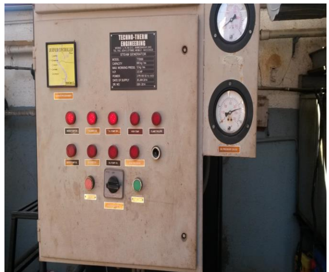
Fig. Electric Panel

This is water storage device in which hot water stored under the process. Insulation are covered to tank so reduce losses and maximum output given.